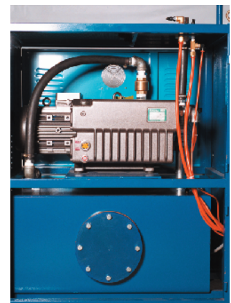
真空機內部 Vacuum machine interior